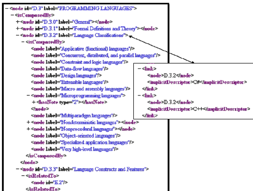
Figure 1 ACM CCS short sample and an XML translation of the native implicit descriptors list

theoretical approach, although functional, is inadequate to enrich the ontology while remaining close to the user. Indeed, this tool is designed to adapt to the user by exchanging knowledge. But in the case previously described, this specification is achieved by the system for the final user. The second use of these descriptors is to provide the users with the opportunity to submit their own interpretation. These synonyms are then classified as keywords and stored for future researches. These keywords will not be able to be seen during browsing, but they will be included for the future researches. The process will also be applied when added co-occurrences expressions. Creations of 'IsRelatedTo' arcs between keywords and descriptors will be created.