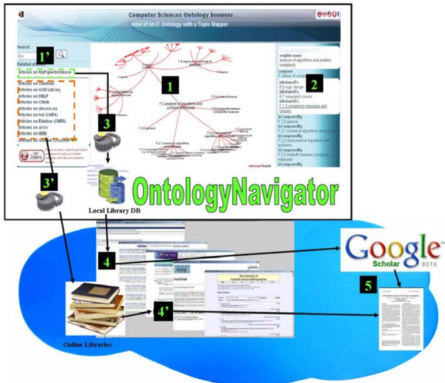
Figure 3 Functional scheme

While a natural language search on all words in the order established will have little chance of success, a search by key words will have every chance to return hundreds of thousands of results. The first step in generating request is the filtering of 'noise' on the label when positioning the user's browser in the ontology thanks to the stop-lists (one in each language), which will eliminate empty words, like pronouns and nouns, which are too common for significant meaning. A similar preliminary stage is conducted when using a search engine in a natural language search. The second step is the lemmatization of words, followed by a calculation of statistical proximity of all of the words, which have emerged, from the keyword cluster in a branch of the ontology. 19 It may be appropriate to provide a valuation of the keywords in this context? This point could be the subject of a further study.